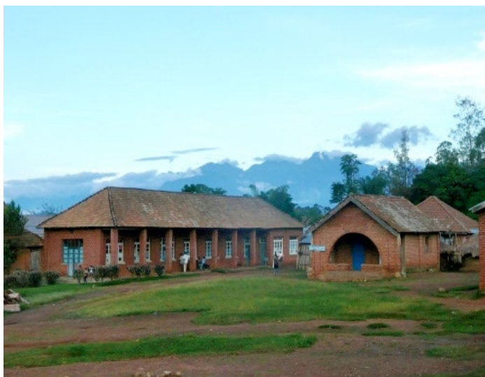
1. The orphanage building with the Rwenzori Mountain as surroundings

The collaboration is a partnership between the order of the Soeurs Oblates de l'Assomption and the association PaidaOrphanage in Switzerland. The current objective of the association is to support the orphanage in Paida and build a new school complex in Beni.