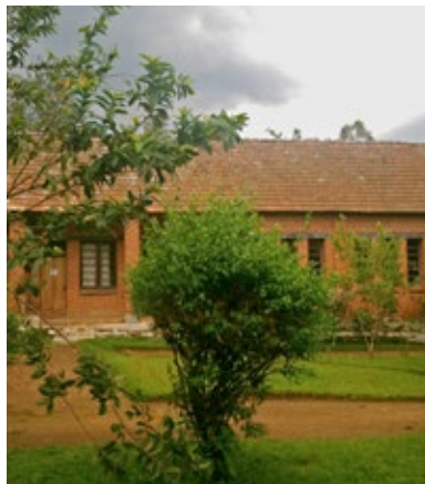
4. Part of the complex that comprises the orphanage, a school and a hospital