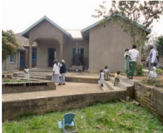
3. The kitchen, dining area and playing area that was built in 2012 with the help of our donors