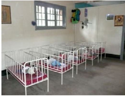
2. The inside of the orphanage with some of the children