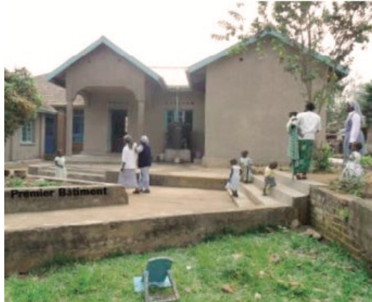
3. The kitchen, dining area and playing area that was built in 2012 with the help of our donors