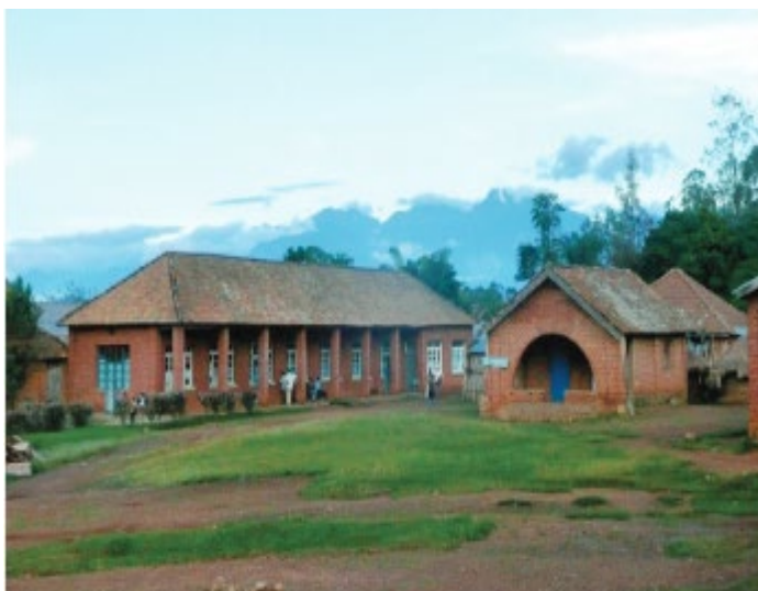
1. The orphanage building with the Rwenzori Mountain as surroundings

The collaboration is a partnership between the order of the Soeurs Oblates de l'Assomption and the association PaidaOrphanage in Switzerland. The current objective of the association is to support the orphanage in Paida and build a new school complex in Beni.