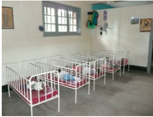
2. The inside of the orphanage with some of the children