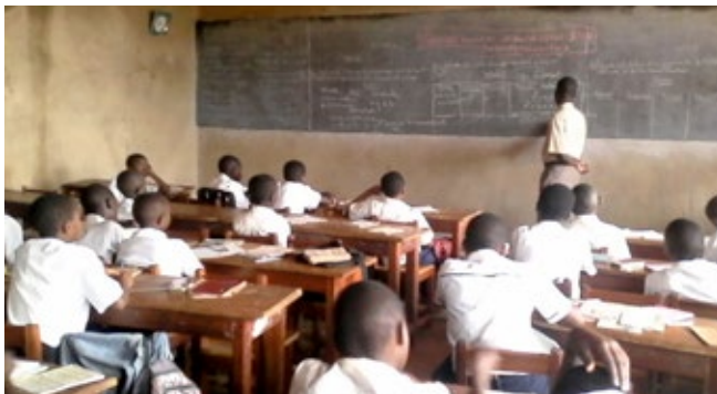
The 8 classrooms already built are being used by 13 teachers and more than 150 students distributed in different class levels.