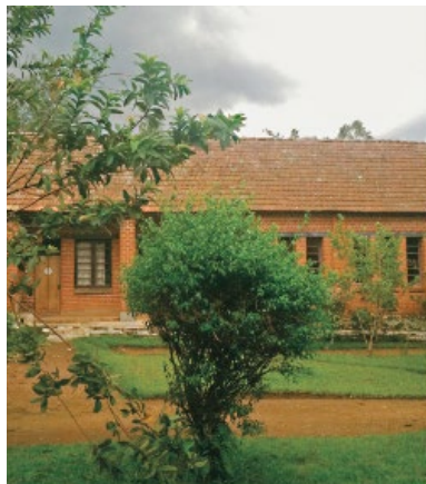
4. Part of the complex that comprises the orphanage, a school and a hospital